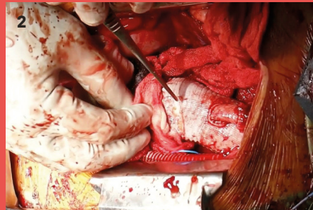
2: Application of TachoSil® between the ascending aorta and arch graft.